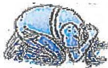
During a tornado crouch down, bend over, and cover your head and neck with your arms.