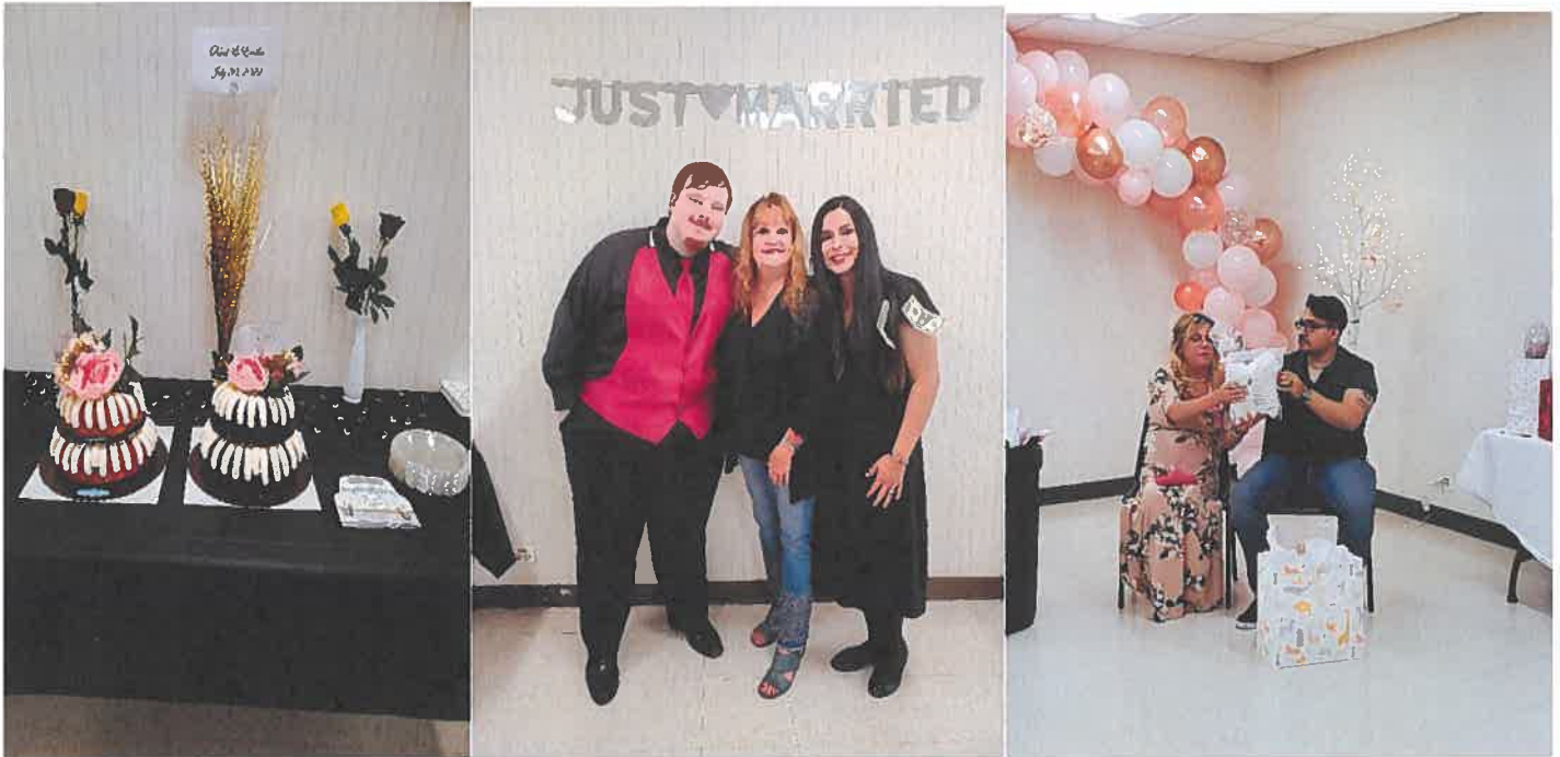
Wedding -performed by our Mayor who is also a minister.

Many people have been asking what the Art Treckler room looks like and how it would be to have a birthday, baby shower etc. Here are some pictures of events held in the room. The pictures really don't do justice to the unique and lovely decorating that was done for both events. Adding your own touch can make your event extra special. Balloons, linen tablecloths, a lighted tree, fresh flowers, small centerpieces etc.